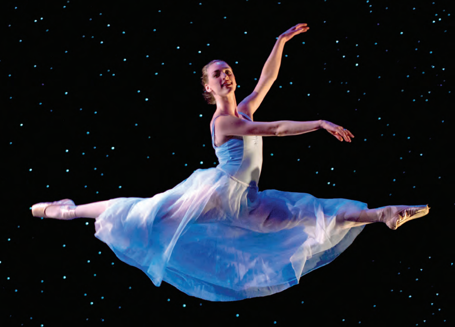
Celebrating 50 years of Dance